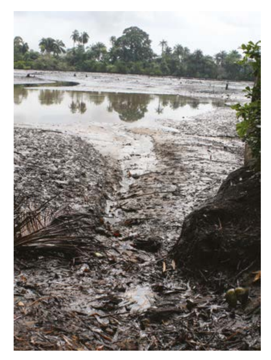
Oil spill at Goi Creek, Nigeria, August 2010.

Wake Up Everyone was awarded first place in the Individual Award in Arts and Humanities Research at the Nigerian Universities Research and Development Fair, 2012.