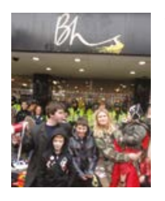
The Institute for the Art and Practice of Dissent at Home.

'Come into my house' (DVD).