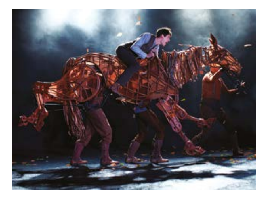
War Horse at the New London Theatre.