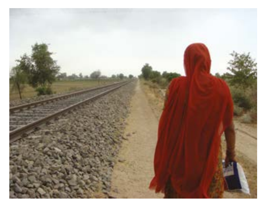
Image from the poster for the 2008 Kali Theatre production of Zameen .