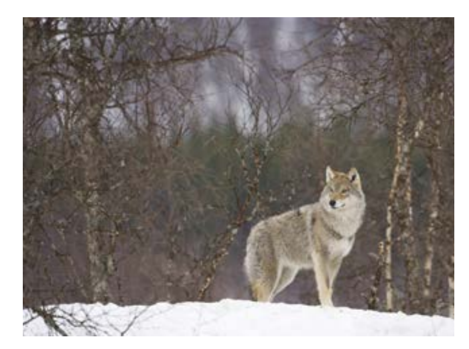
European wolf (Canis lupus) in birch forest, Norway.

Last night, I watched Angela Carter's The Company of Wolves . It's a schlocky, dated horror film, but a classic, driven by Carter's haunting formulation that the really bad wolves are not the ones that howl in the night but the ones who are 'hairy on the inside'.